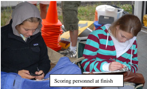
Scoring personnel at finish