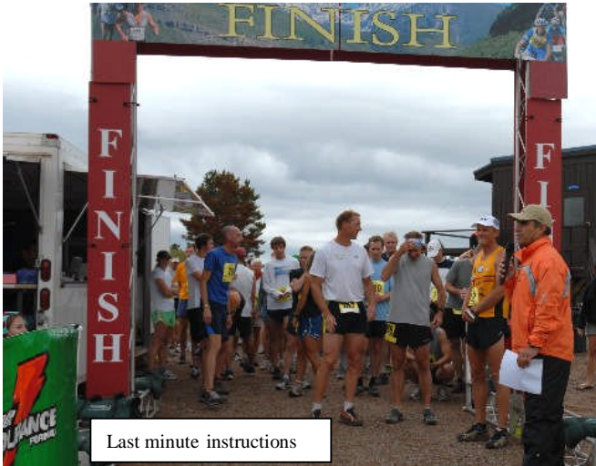
Last minute instructions

Joining series title sponsor La Sportiva ( www.mountainrunning.com ) will be First Bank of Vail, Vail’s Mountain Haus, SmartWool, Tiga Advertising, Howard Head Sports Medicine Centers, Steadman Hawkins, Joint Juice and Gatorade.