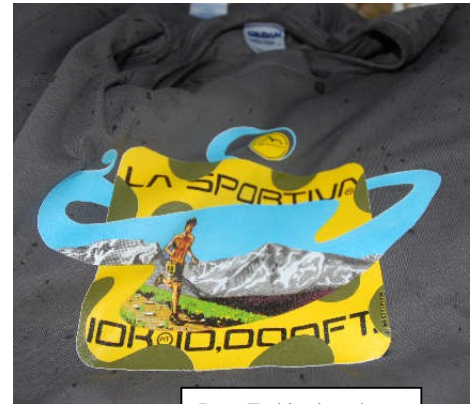
Race T-shirt dotted with raindrops